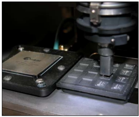
COMPONENT TRAY PICK