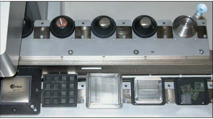
POCKET SYSTEM (5 OR 10 STATIONS)